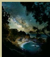
A 10-pane mosaic of McWay Falls in Big Sur, California